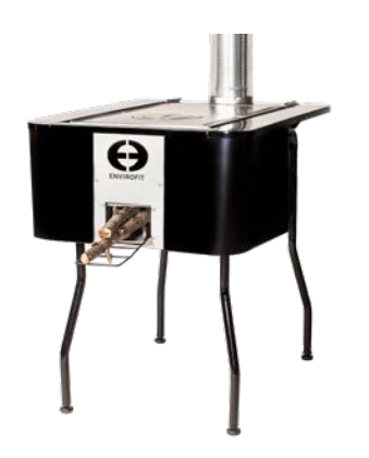
SUPERSAVER GRIDDLE PREMIUM STOVE