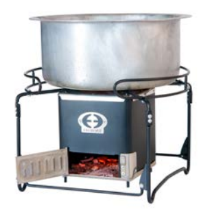
SMARTSAVER CHARCOAL ESSENTIAL STOVE