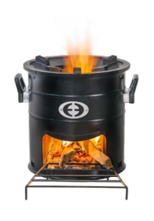
SUPERSAVER AI WOOD (SPANDAN) PREMIUM STOVE