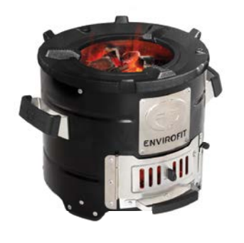
SUPERSAVER CHARCOAL PREMIUM STOVE