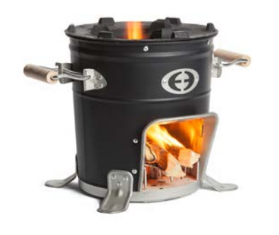
SUPERSAVER GL WOOD PREMIUM STOVE