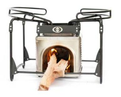
SMARTSAVER WOOD ESSENTIAL STOVE